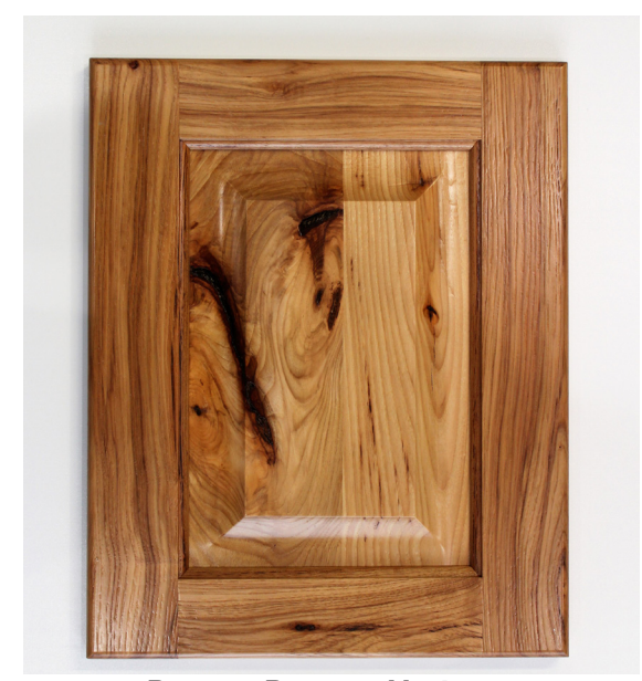
Rustic Brown Hickory