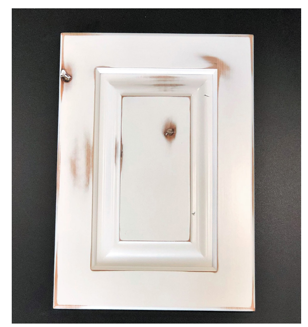
White Rub Through