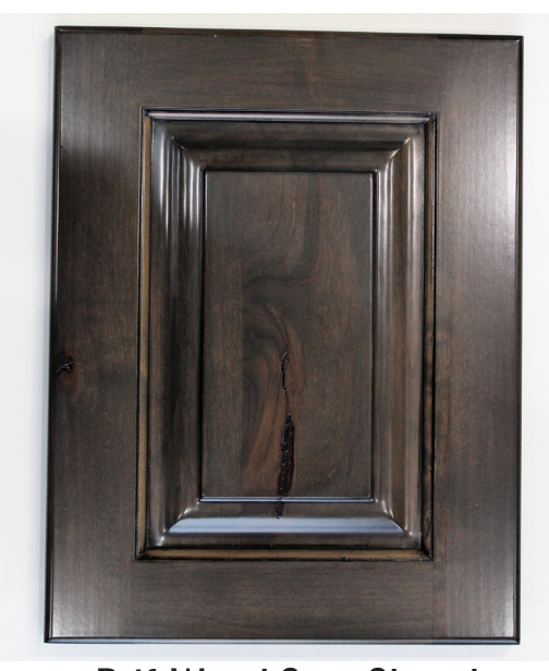
DriftWood Grey Glazed