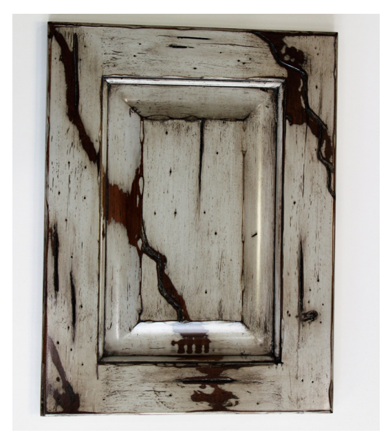
Grey Serious Antique