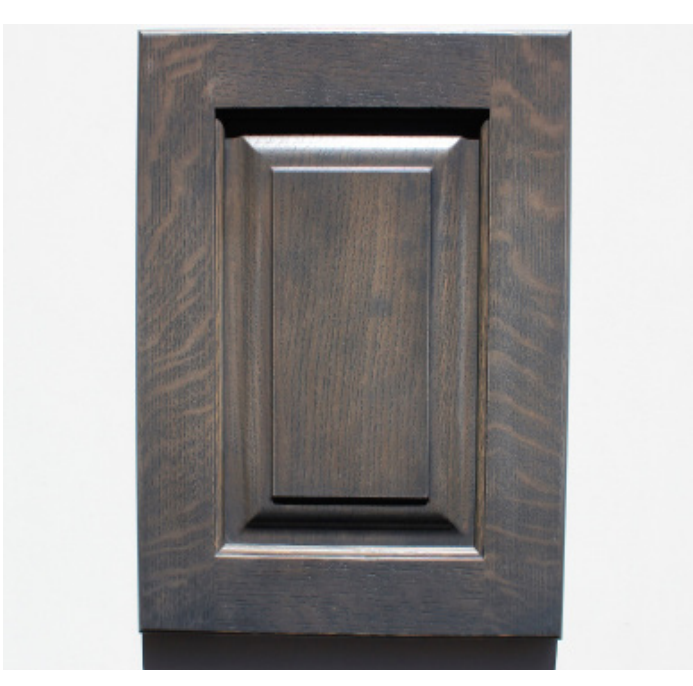
Miter Door for Anthias