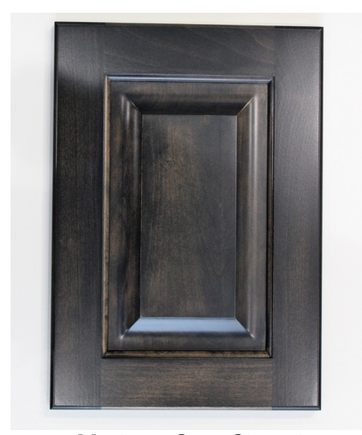
Medium Grey Glazed